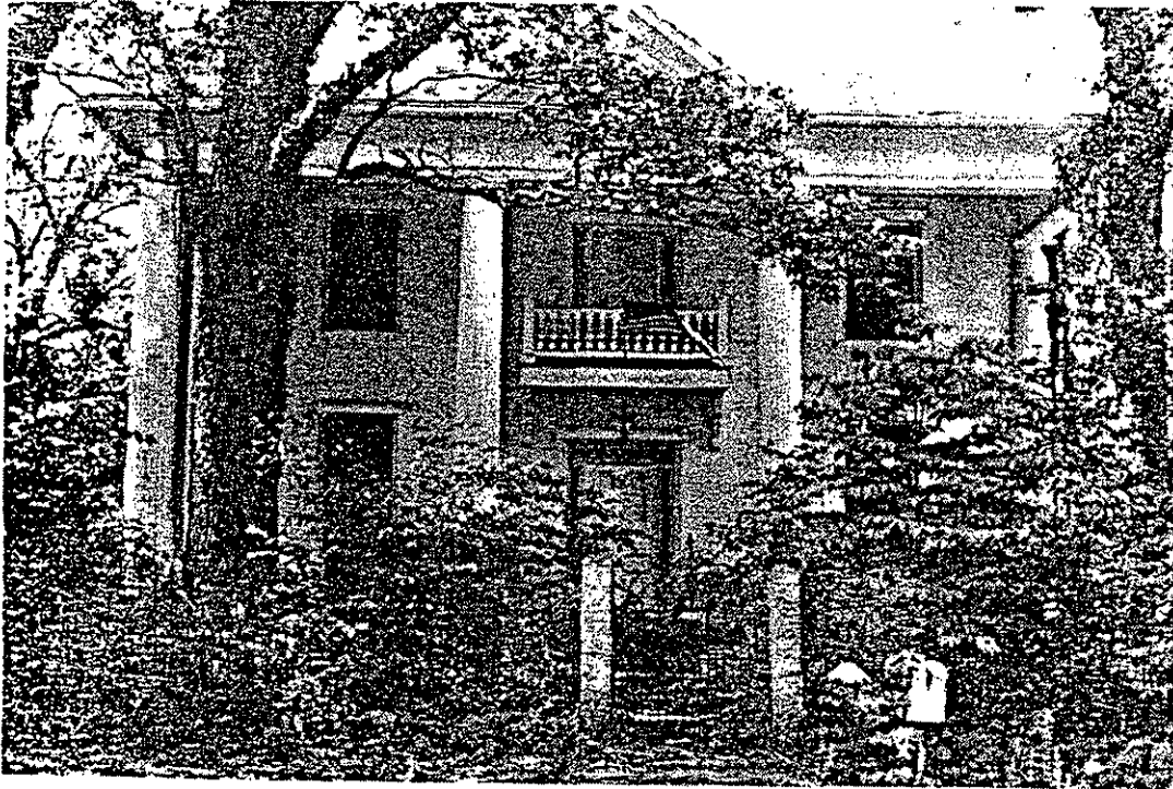
The Wells Dalton House.

It is quite pleasant to stand in the shade of the wide gallery and admire the fine old oaks in the now small yard. It is as if the delicate iron fence safeguards and nurtures a part of the past at 1036 Ridge Avenue.